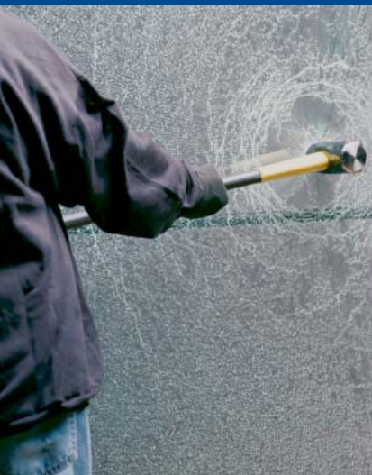
MADICO PROTEKT SAFETY FILM