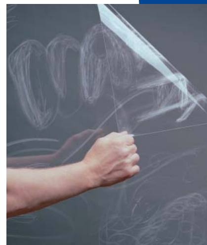
MADICO GRAFFITI-FREE FILM

Some Madico Safety & Security Window Films are designed to deter criminals from smash-and-grab theft. Our security films help